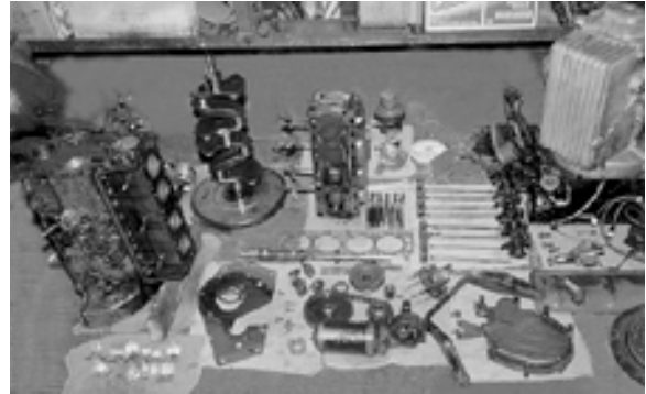
Late Model XPAG engine

length, compression ratio, camshaft timing, brake horse power rating, and many other similarities. Although changes were made between 1939 and 1955. The inherent design characteristics of the engines were the same.