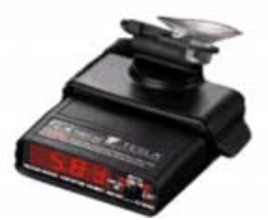
G-TECH Performance Meter Pro

Tesla Electronics manufactures a very unique product. It's called the G-TECH/Pro. The product has been around for a number of years. In 1995 the original G-TECH product garnered SEMA (Specialty Equipment Market Association) "Best New Accessory." The latest configuration includes new Digital Signal Processing algorithms coupled with a precision Silicon Accelerometer.