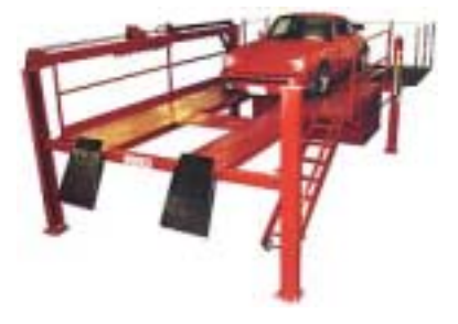
Dynojet Automotive Chassis Dynamometer

Dynojet's Automotive Chassis Dynamometer is widely used in the country for testing and is the officially licensed NASCAR dynamometer. This chassis dyno uses 48-inch knurled, precision balanced drums. The car is actually driven and can attain speeds up to 160 mph.